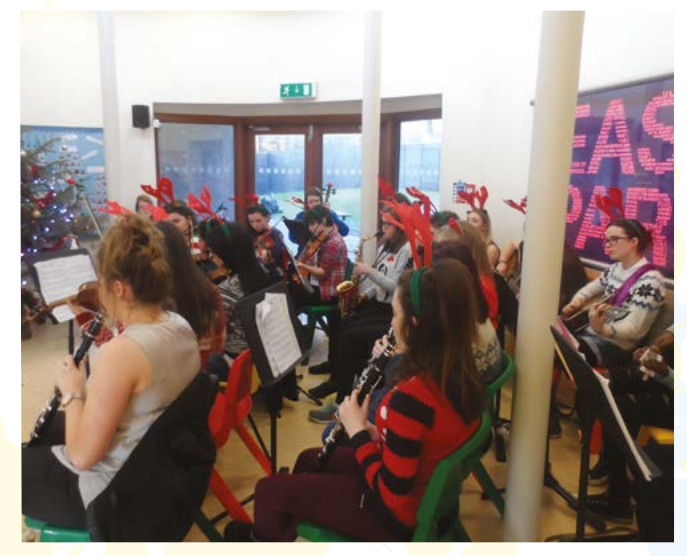
Notre Dame High School Orchestra in the festive spirit

Through their Christmas Sale of items donated by local businesses, staff and