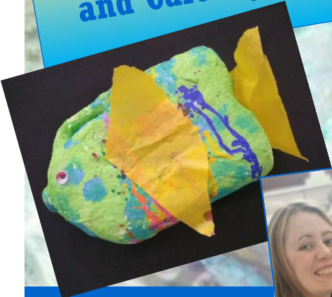
Ocean Art: our hub has disappeared under the sea! Dolphins, fish and octopuses are swimming around lighting up the school ♡